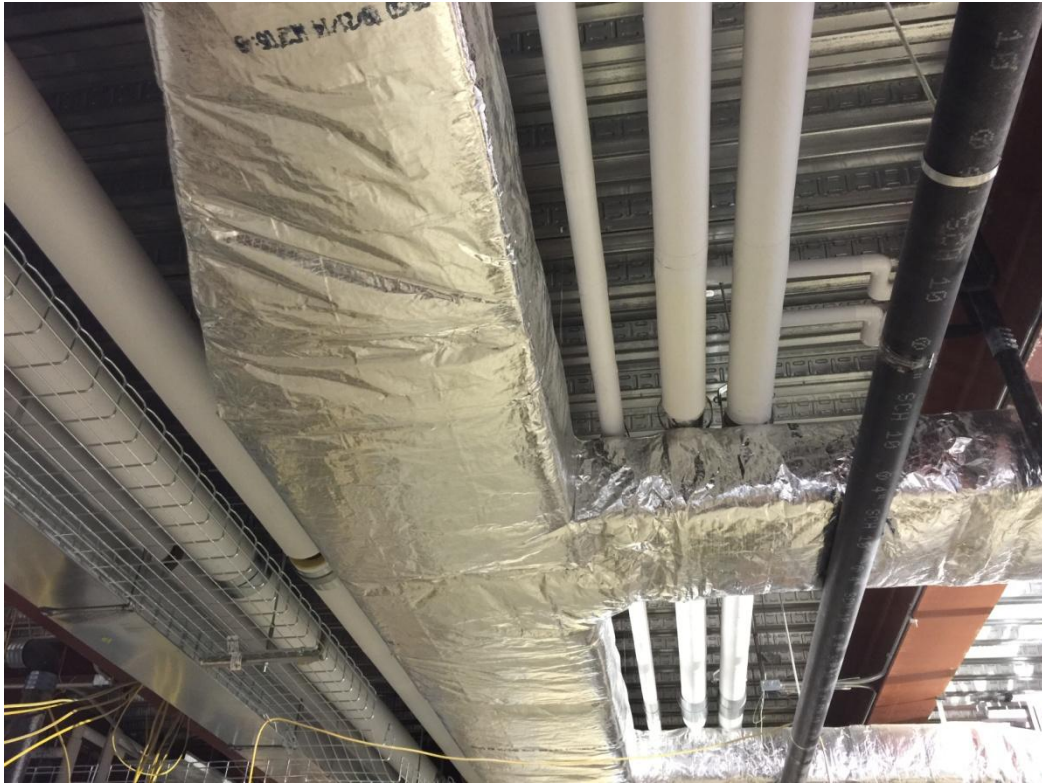
Duct & Pipe insulation