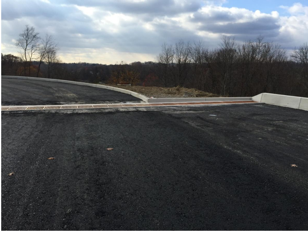
Parking Lot paved