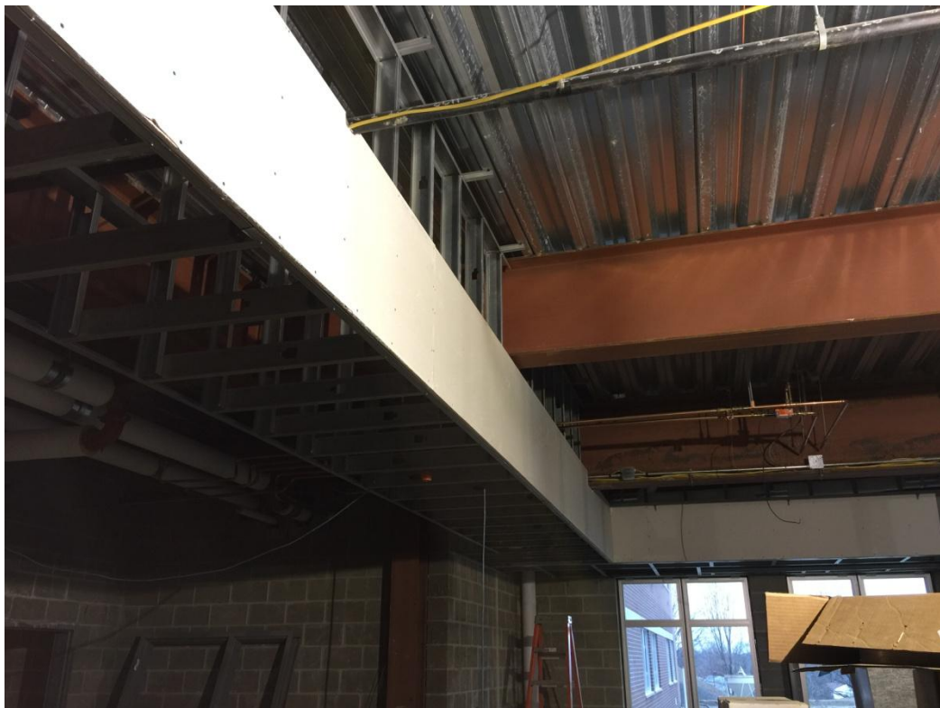
Bulk heads in library