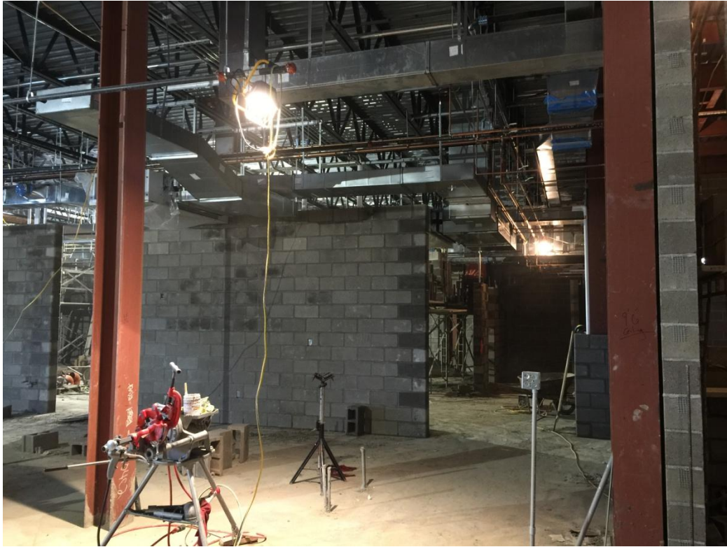
Kitchen area walls